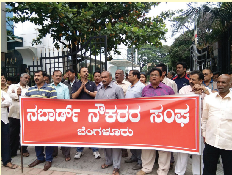
Trade unions cutting across political lines have stalled the nation on 2nd September, 2016