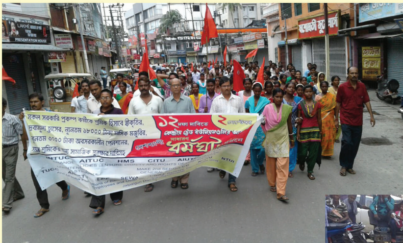
The National Convention of decided Central Trade Unions, General Strike on 2nd September, 2016