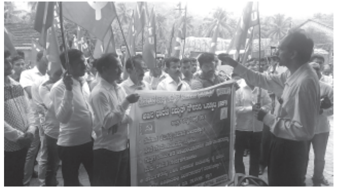
Demostration of Electricity Workers