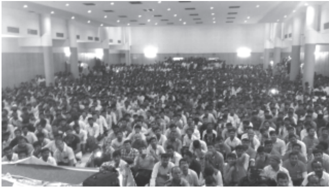
Participants of open Conference